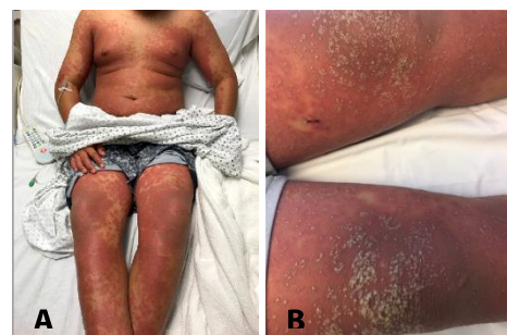
Figure 1. A) Diffusely distributed erythematous patches and indurated plaques on the abdomen, arms, and legs. B) Diffuse erythematous indurated plaques studded with multiple pustules on the lower extremities.

A previously healthy 13-year-old boy presented with a six-day history of a progressive rash associated with pruritus and burning sensation. He also had fevers, arthralgias, and recent nonproductive cough and rhinorrhea. Physical examination revealed pink-to-dusky macules coalescing into patches, scattered targetoid lesions, and erythematous indurated plaques with multiple overlying one millimeter (mm) pustules distributed diffusely on the back, chest, axillae, abdomen, arms, and legs ( Figure 1 ). Erythematous macules on the buccal mucosa and a small erosion on the hard palate were also noted. An ophthalmology exam revealed conjunctival injection with diffuse flecks of subconjunctival hemorrhage and no fluorescein staining.