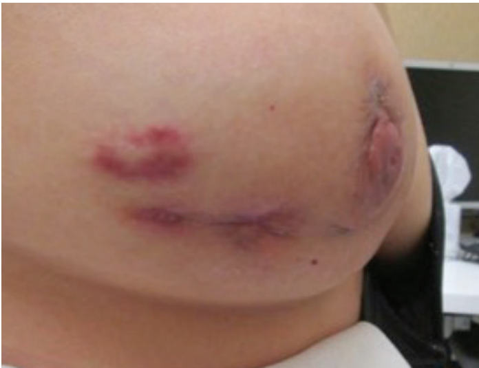
Figure 2. Granulomatous mastitis, clinical. Erythematous nodule on the right breast of the patient, with core biopsy demonstrating chronic mastitis.

approximately 1 hour; she demonstrated two tender hyperpigmented nodules on the right anterior legs measuring 2x3cm and 1cm in diameter, respectively. Musculoskeletal exam demonstrated tenderness to palpation at the ankles and first CMC joints without evidence of synovitis.