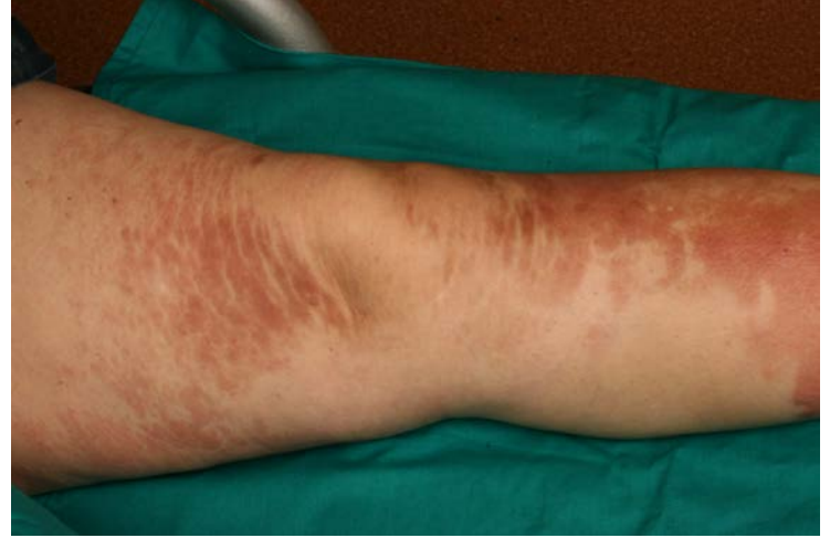
Figure 1. Confluent, red, edematous plaques. Figure 2. Note the unilateral plaques suggesting an underlying venous stasis.