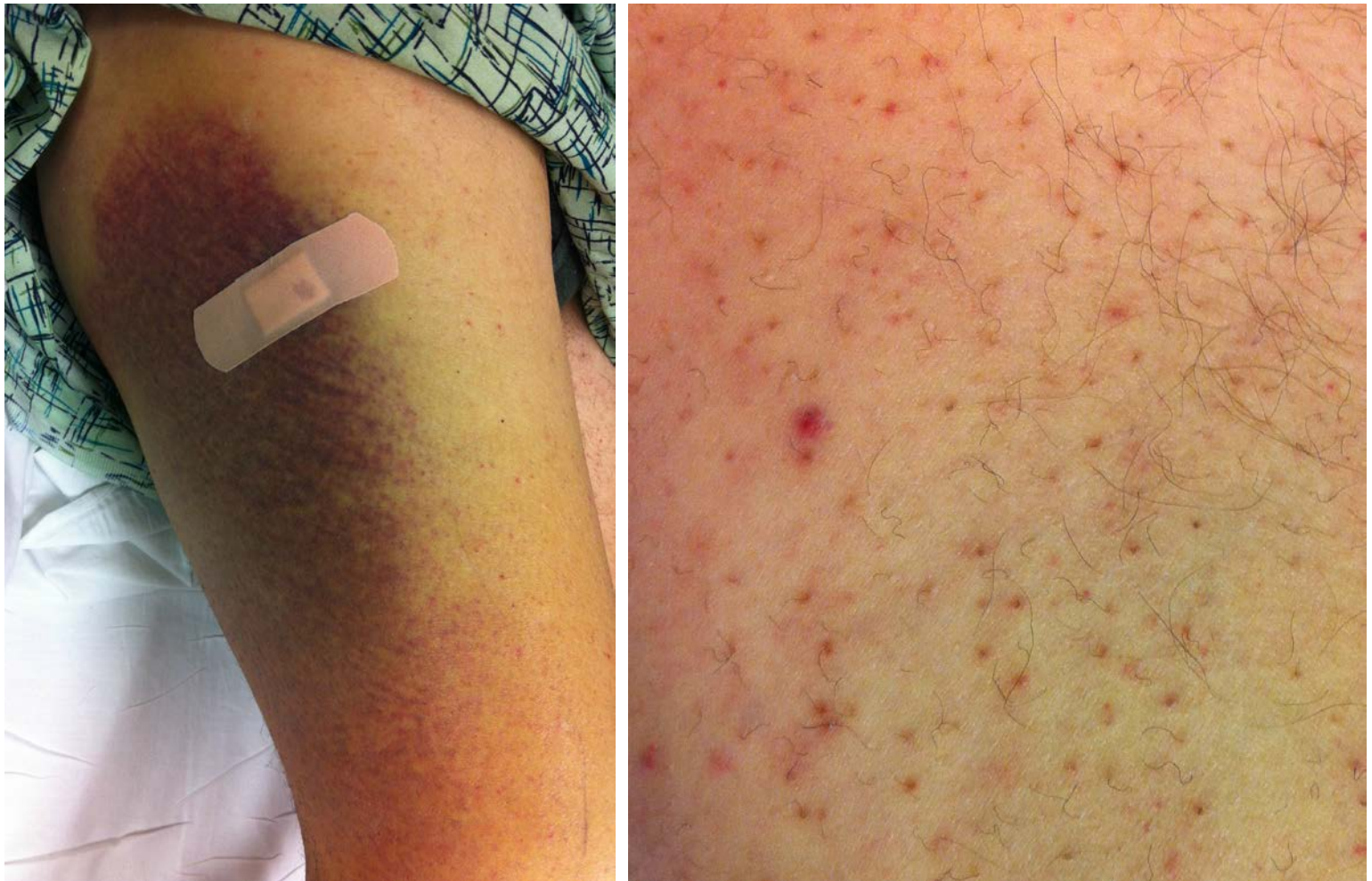
Figure 1. Large, dusky, violaceous ecchymosis on right lateral thigh. Figure 2. Corkscrew hairs amongst a background of perifollicular hemorrhages and pinpoint palpable petechiae

Physical exam revealed a large ecchymosis covering the majority of the right lateral thigh (Figure 1). A 10-centimeter ecchymosis was present on the right lower abdomen, along with a 2-centimeter ecchymosis on the right shaft of the penis. Innumerable 2 to 3-millimeter red palpable petechiae were evident bilaterally on the anterior shins in a dependent distribution, extending up to the distal aspect of the left thigh (Figure 2). Many corkscrew hairs were present amongst the petechiae (Figure 2).