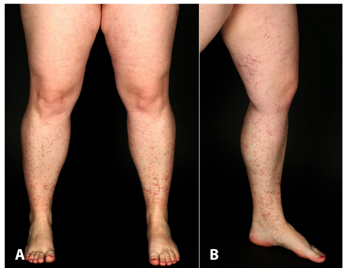
Figure 1. A) Overview of both lower extremities with disseminated palpable purpuric papules. B) Left leg showing the extent of the papules.

A 31-year-old woman presented to our outpatient department with multiple palpable purpuric papules disseminated on her legs, lower arms, and lower abdomen ( Figure 1 ). The papules first appeared on her legs together with fever one day after her second Pfizer/BioNTech vaccination. The flare had been treated by her primary care doctor with a low dose of 5mg oral prednisone. After an initial improvement she noted a quick recurrence and progression of the papules to the lower abdomen. She denied any other complaints, infections, or medication. Her medical history was unremarkable. We admitted the patient for further diagnostics and treatment.