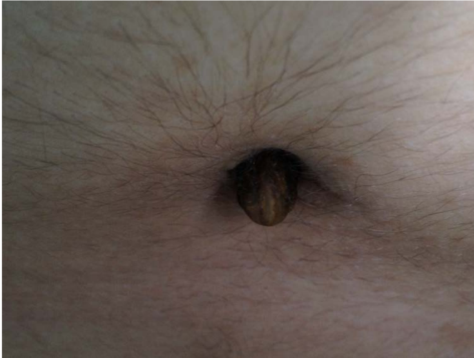
Figure 1. The umbilical concretion measured approximately 2 centimeters in length. The concretion was firm with dark brown color.

Awareness of the diagnosis of omphalolith is important owing to the rarity of the condition and the need to differentiate it from other benign and malignant conditions of the umbilicus, including keloid, dermatofibroma, cholesteatoma, malignant melanoma, umbilical endometriosis, primary umbilical malignancy, and umbilical metastasis. The latter is also referred to as a Sister Mary Joseph nodule [2,5].