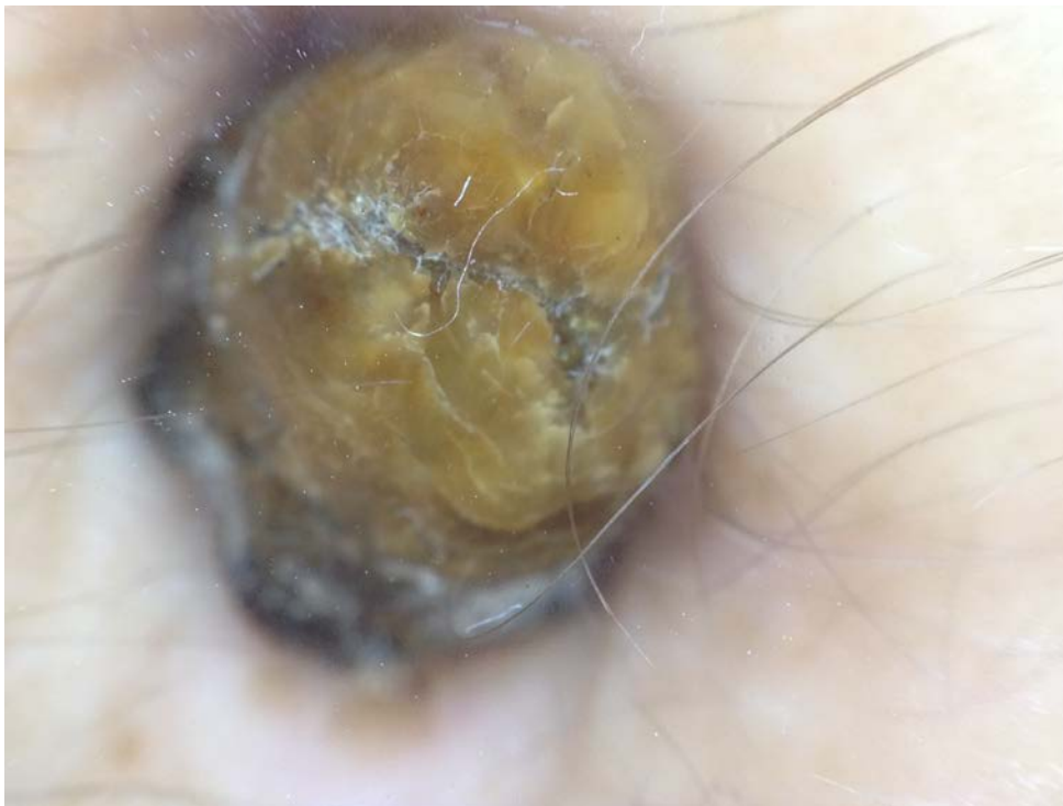
Figure 2. The dermoscopic examination did not show a pigmented network. There were no globules, dots, or vascular patterns. It exhibited a dry crusted appearance.