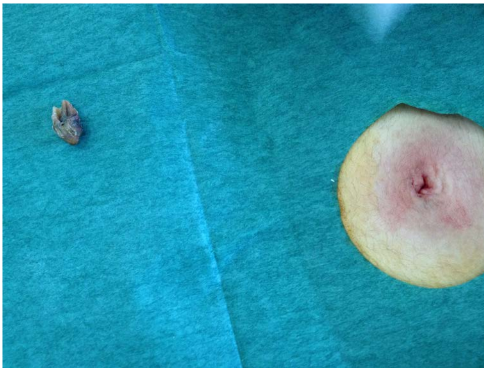
Figure 3. The appearance of the lesion after extraction.

Histologic examination showed that it contained laminated keratin, amorphous material resembling sebum, numerous terminal hairs, and scattered collections of bacteria. Moderate amounts of argentaffin staining material were detected throughout the specimen and the black color of the lesion probably related to melanin and oxidized lipids, much like an open comedone [1,5].