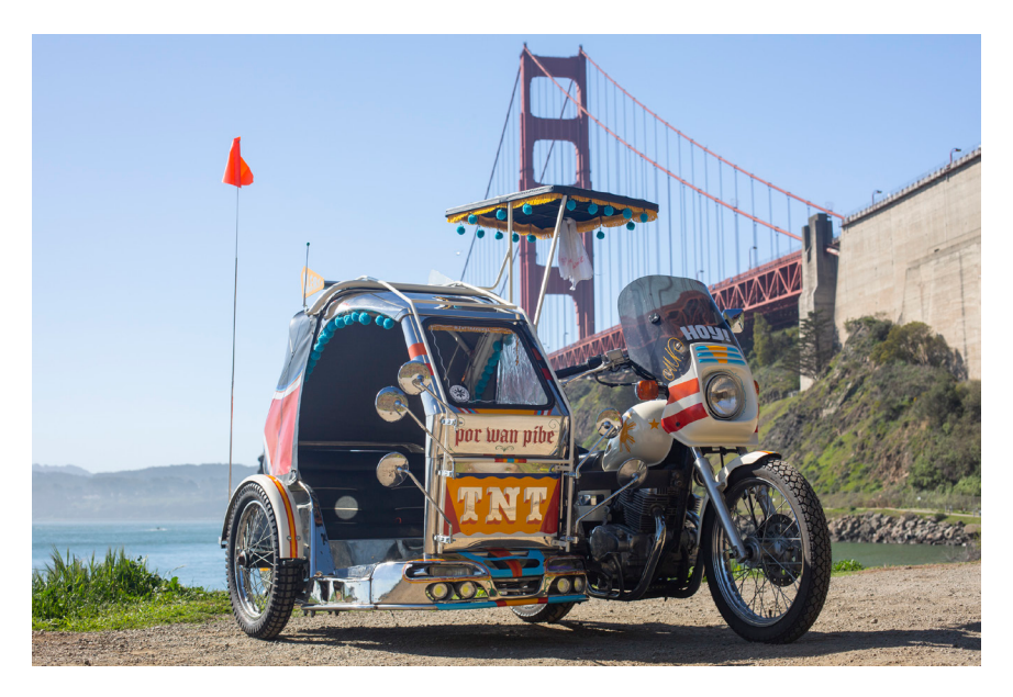
TNT Traysikel at the Golden Gate Bridge