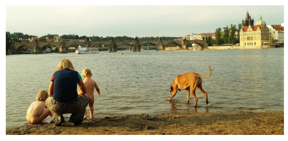
Prague Pictures, V. Vad Erent (2010)