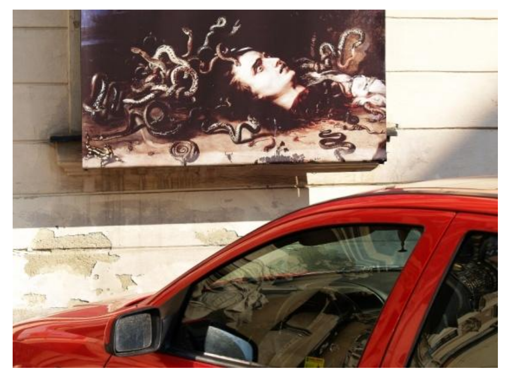
Prague Pictures, III. Vad Erent (2010)