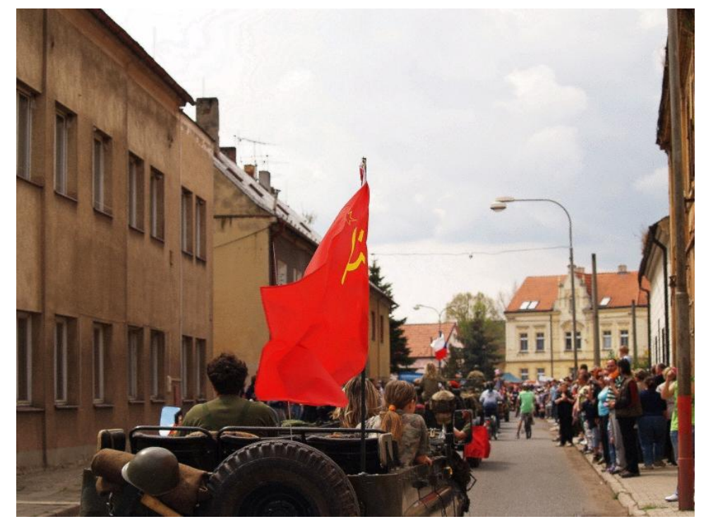
Kryry May Day II. Vad Erent (2010)