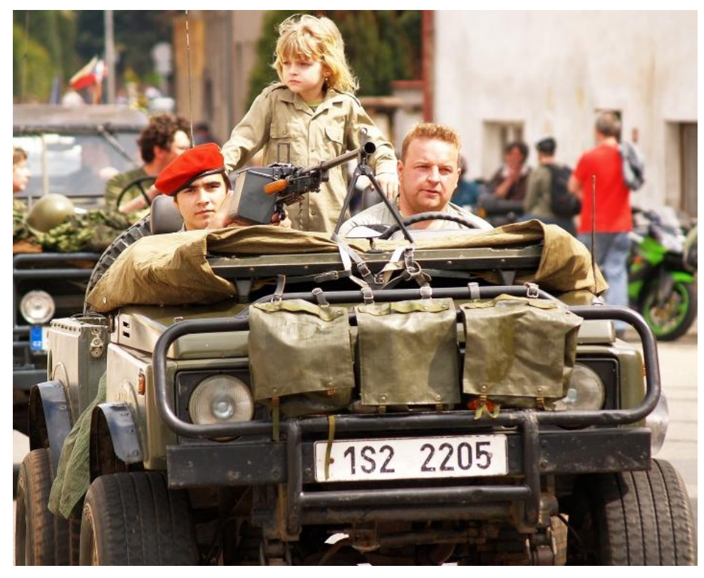
Kryry May Day, IV. Vad Erent (2010)