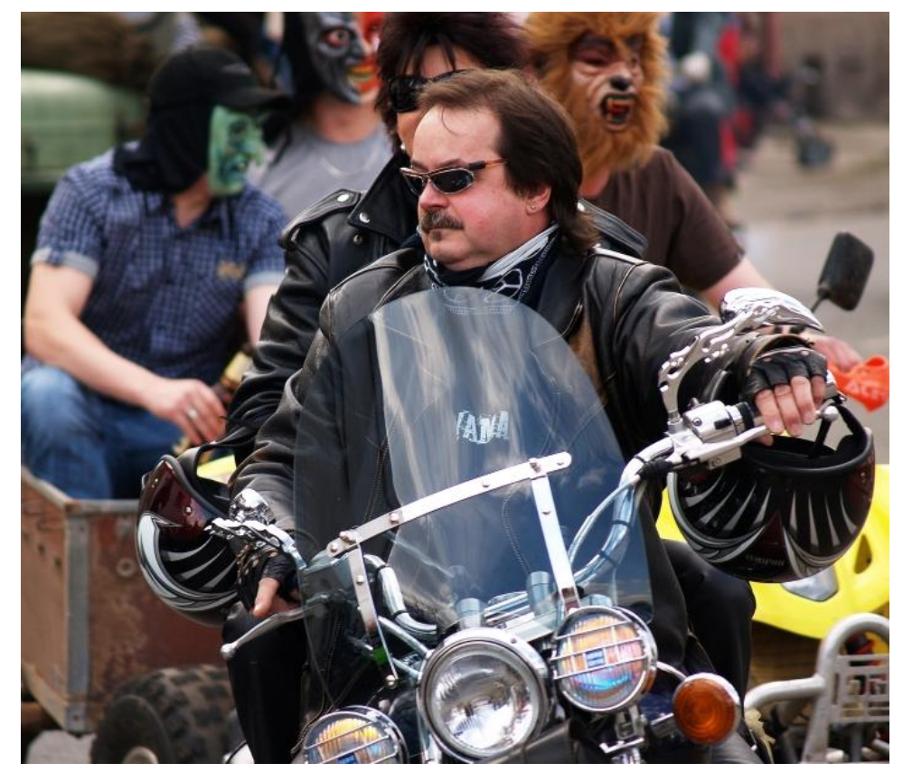
Kryry May Day I. Vad Erent (2010)