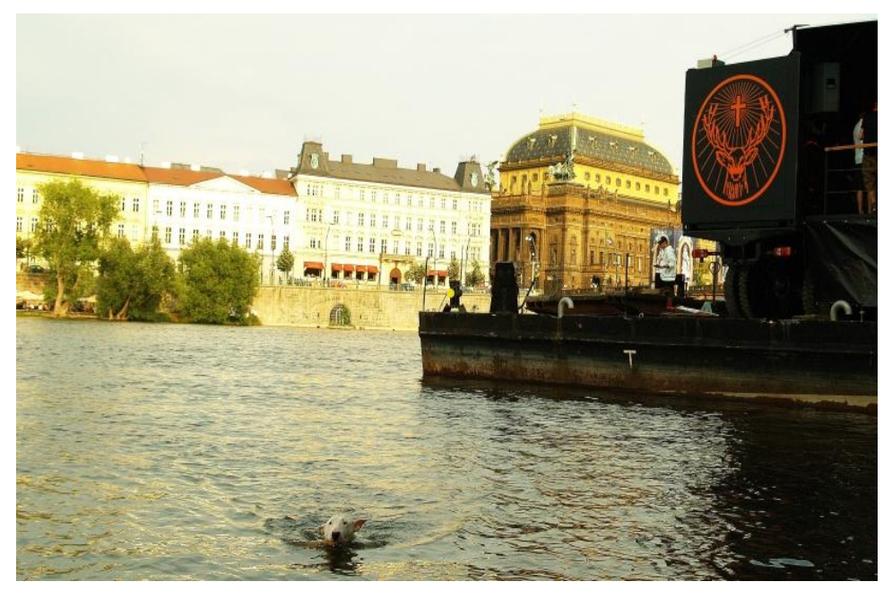
Prague Pictures I. Vad Erent (2010)