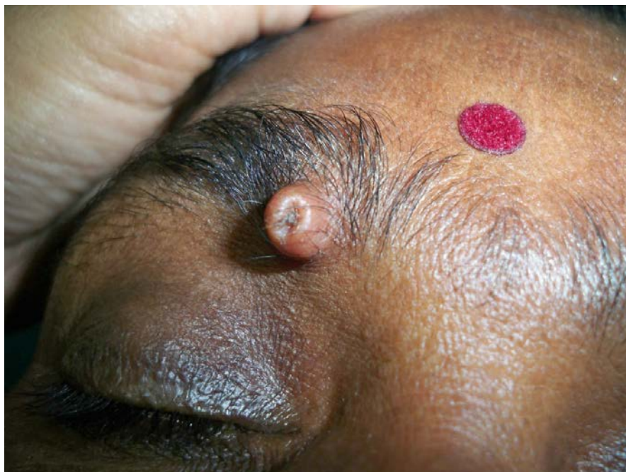
Figure 1. Solitary skin colored shiny, firm, umbilicated nodule with keratinous plug and few terminal hairs emerging over infero-medial aspect of eyebrow.

Examination revealed a solitary skin colored shiny, firm, non tender nodule of size 0.9X 0.5X 0.5 cm over the infero-medial aspect of the right eyebrow. The nodule had an umbilication in the center with a keratinous plug and a few terminal hairs emerging from it (Figure 1). No other mucocutaneous abnormality was detected and systemic examination was unremarkable. The nodule was excised and sent for histopathological examination.