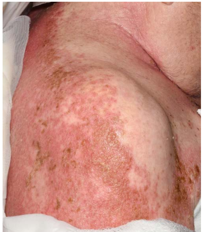
Figure 1. Erythematous verrucous papules involving the back and extending to the posterior neck.

Physical examination revealed erythematous and brown verrucous papules on the post-auricular and nasolabial area as well as the eyebrows, upper back, central chest, lower abdomen, and groin ( Figure 1 ).