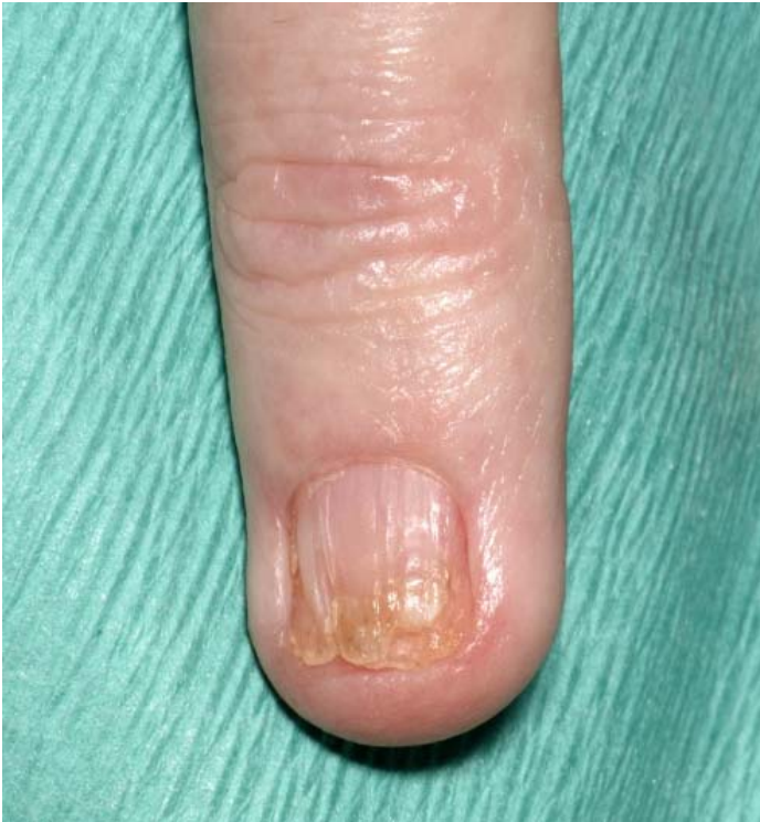
Figure 2. Fingernail demonstrating longitudinal ridges and V-shaped nick at the free edge.

There was evidence of crusting and erosions on the right side of the neck and lower abdomen. The nails were brittle and demonstrated longitudinal ridges with red lines and a V-shaped nick at the free edge ( Figure 2 ).