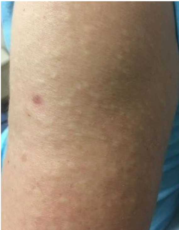
Figure 2. Firm papules on arm.

increase glycosaminoglycan (GAG) synthesis [2]. This theory is supported by evidence that certain cutaneous mucinoses are associated with increased levels of serum immunoglobulins and circulating autoantibodies. Also, the cytokines IL-1, TNF-alpha and TGF-beta are known to stimulate GAG synthesis, and might contribute to mucin deposition [2].