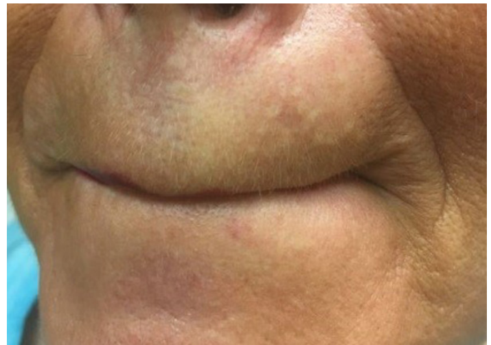
Figure 3. Firm papules on face.

usually sparing the face. The lesions progress slowly without induration or systemic involvement. Rarely, they resolve spontaneously [3].