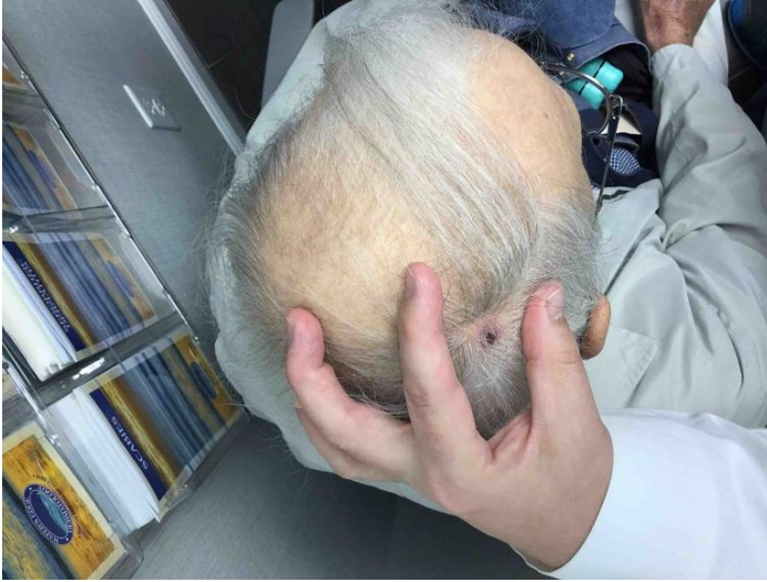
Figure 1. Initial presentation of metastatic cutaneous lesion. Pearly bluish-red nodule with surrounding erythema located on the right parietal scalp.

adenocarcinoma and metastatic adenocarcinoma. Preliminary immunohistochemical stain revealed Ber-EP4 positivity, CAM5.2 positivity, CK5/6 negativity, and podoplanin negativity. Additional immunohistochemical stains were performed to distinguish a primary cutaneous carcinoma from a metastatic carcinoma. The tumor was strongly positive for NKX-3.1, cytokeratin 20, and ERG ( Figure 3 ). Stains for EMA, cytokeratin 7, TTF-1, P63, and CDX-2 were all negative. PSA and PSAP were not performed. Nevertheless, the positive NKX-3.1 and ERG confirmed metastatic prostate adenocarcinoma, whereas the negative P63 stain helped distinguish metastatic carcinoma from a cutaneous adnexal tumor.