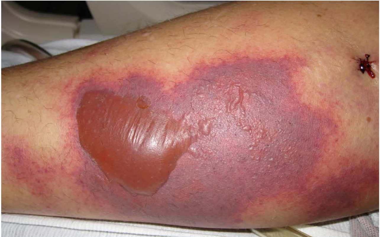
Figure 1. Purpuric plaque with hemorrhagic bulla on lower extremity

hematologic workup, the pancytopenia was attributed to PTU and the drug was discontinued, although her blood cell and platelet counts continued to decline over the next few days with a white blood cell count as low as 500, hemoglobin of 6.2 g/dL and platelet count of 17,000. During this time, the patient developed upper eyelid edema and purpuric plaques on her forehead and distal extremities, some of which progressed to hemorrhagic bullae (Figure 1). She was started on broad-spectrum antibiotics, although an extensive infectious workup was negative.