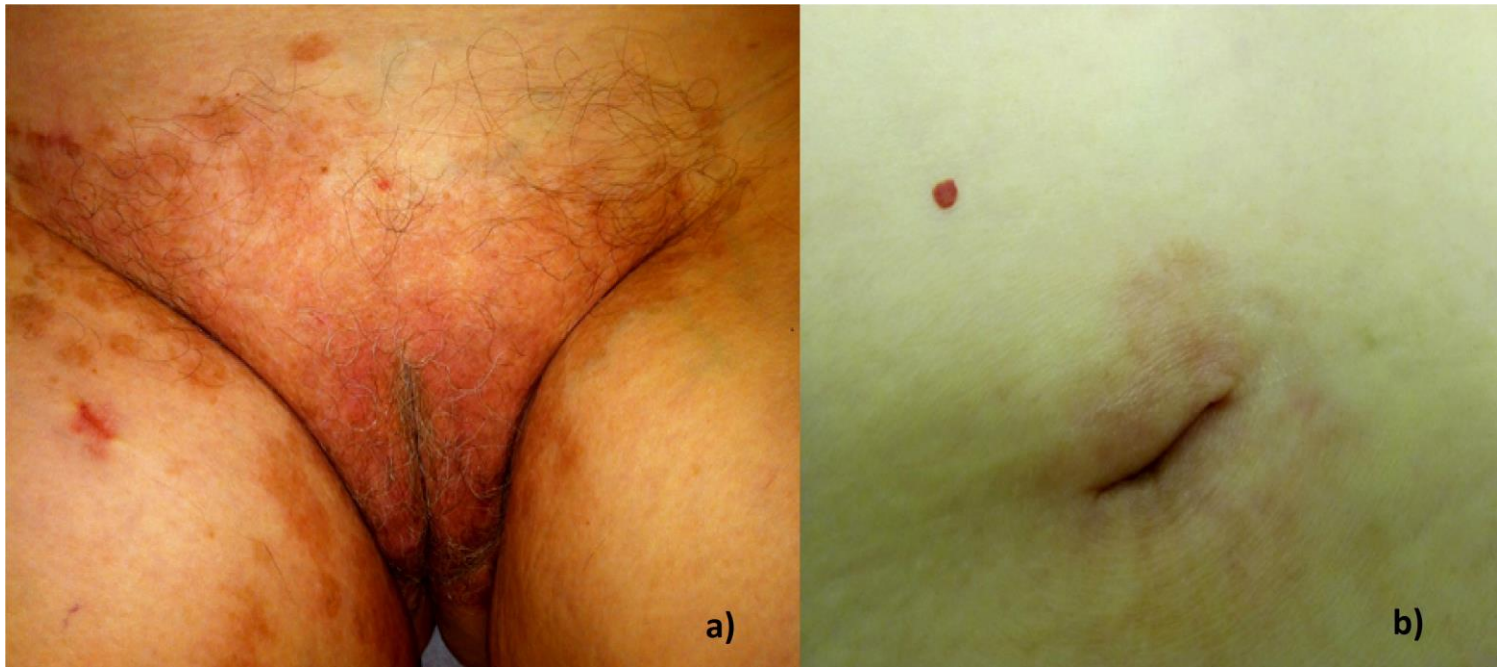
Figure 3. Residual hyperchromic macules after one week of treatment on the vulva (a) and the periumbilical region (b).

Based on these findings, the diagnosis of PV was made. The patient was treated with oral amoxicillin/ clavulanic acid 875/125mg twice daily during two weeks and oral prednisolone 40mg/day (0.5mg/kg/day), which was gradually withdrawn over 1 month. The skin lesions cleared to residual hyperchromic macules within the first week of treatment (Figure 3) and there was no recurrence of the disease after 12 months of follow-up.