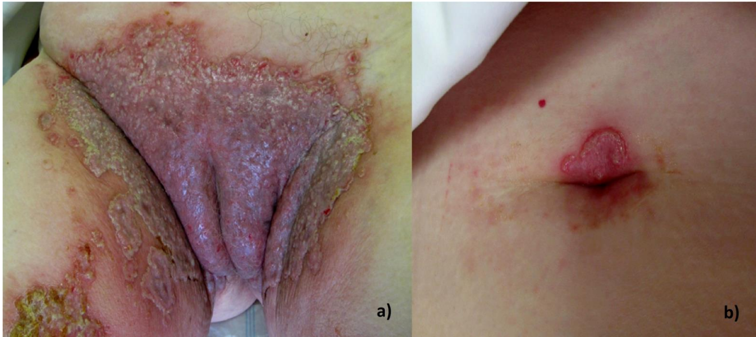
Figure 1. Vegetating pustular exudative plaques on the vulva with extension to the internal face of the thighs (a) and the periumbilical region (b).

A 79-year-old woman, previously healthy, was observed for a painful eruption of the vulva with 3 months of evolution. She completed multiple antibiotic courses without improvement. On physical examination, she presented with well defined vegetating pustular exudative plaques on the vulva with extension to the inner thighs and the periumbilical region (Figure 1). She had no lesions on oral or vaginal mucosae.