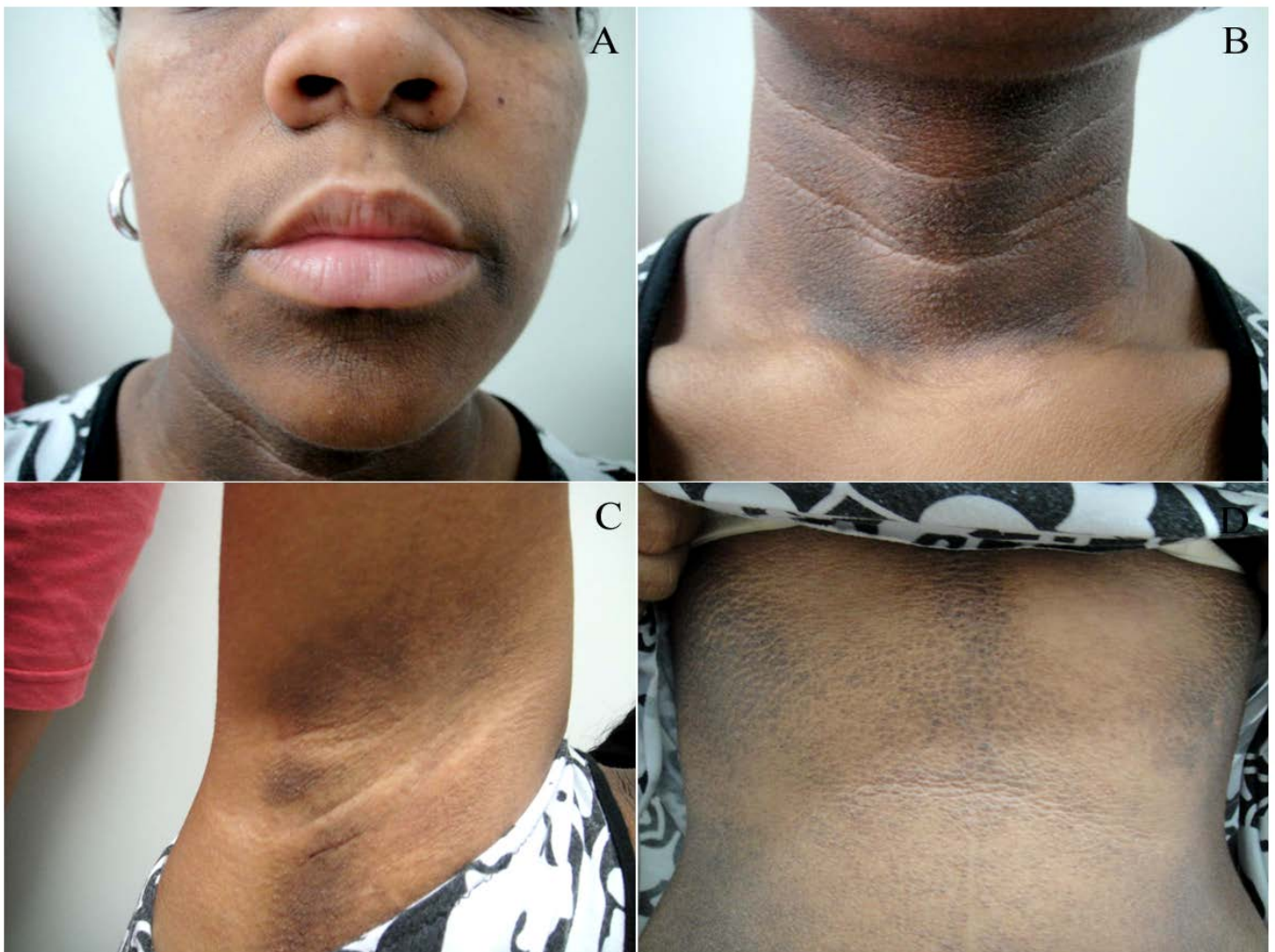
Figure 1. A. Symmetrical velvety hyperpigmentation of perilabial skin. B. Verrucous velvety hyperpigmentation in the anterior cervical region. C. Papillomatosis and hyperpigmentation in the right axillary region. D. Thickening and hyperpigmentation of the lumbar region skin.

Tests for assessment of biochemical, hormonal, and hematological parameters showed no abnormalities. Blood count, T3, T4, TSH, insulin, prolactin, cortisol, total/free testosterone levels, IGF-1, growth hormone, hemoglobin A1C, sedimentation rate, calcium, phosphorus, cholesterol, triglycerides, LDL, HDL, liver and kidney profiles, and oral glucose tolerance were all within normal limits. The measurement of tumor markers was negative. The computerized tomography scans of the skull, chest X-ray, and abdominal ultrasound detected nothing abnormal. Histopathology showed hyperkeratosis, acanthosis, and papillomatosis (Figure 2).