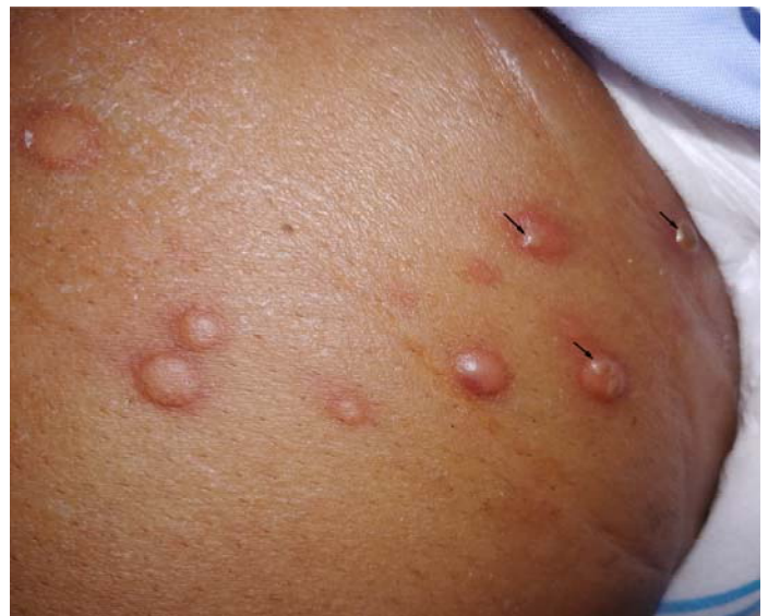
Figure 1. Scattered indurated erythematous nodules over the right thigh. Some nodules have overlying vesicles (arrows).

started in the peri-ampullary region (of the duodenum), then progressed to the retro-peritoneum in July 2018, and the breast in December 2018. She had 6 cycles of R-CHOP (rituximab, cyclophosphamide, adriamycin, vincristine, and prednisolone) chemotherapy but did not achieve clinical remission. She later received two cycles of bendamustine and obinutuzumab. In January 2019, she presented with a 2-week history of asymptomatic localized blisters over her right thigh. Her lesions started to appear two months following her last chemotherapy cycle. Those lesions had been treated by the primary oncology team with intravenous acyclovir for more than one week with no improvement. Physical examination demonstrated several scattered one cm indurated erythematous nodules, some with overlying vesicles, on her right thigh ( Figure 1 ). Histopathological