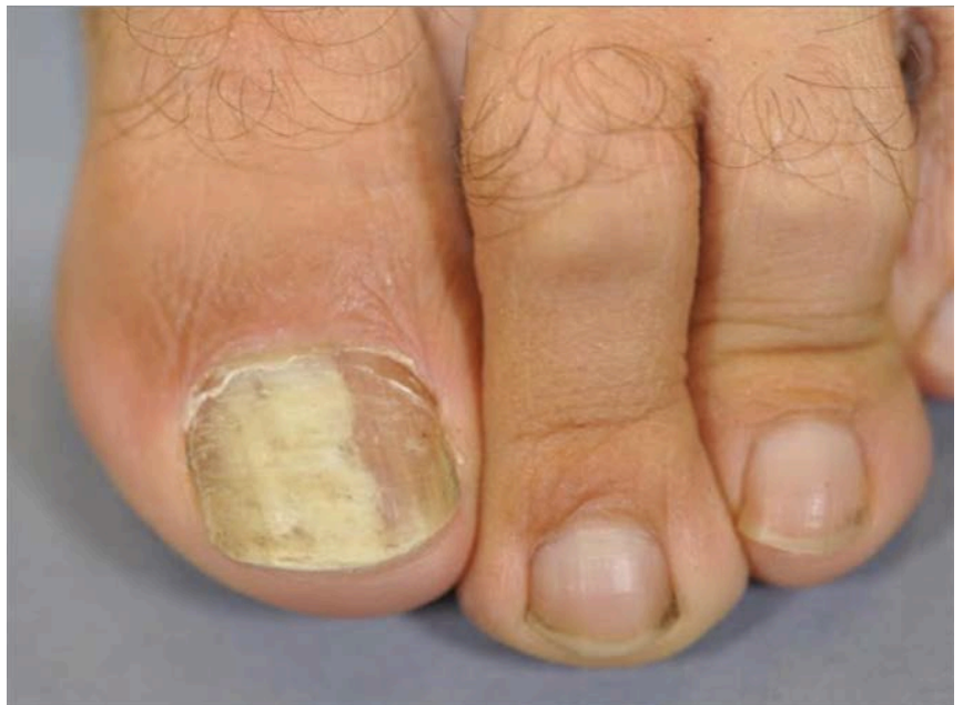
Figure 1. Left great toenail with wide yellow-white longitudinal band involving a majority of the nail plate. No subungual debris, hyperkeratosis or paronychia inflammation is present in the affected nail.

Physical Examination: The left great toenail revealed a seven millimeter-wide milky, white-yellow longitudinal band, extending from the cuticle to the free margin, without distal onycholysis or subungual hyperkeratosis (Figure 1). Distally, the plate showed lamellar splitting only. There was no nail fold scaling