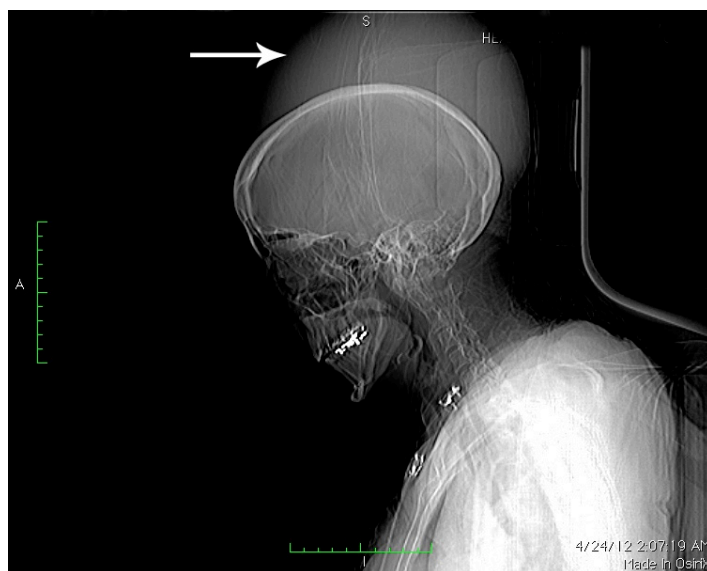
Figure 1. Computed tomography scout film demonstrating cephalohematoma.

with the on-call neurosurgeon and subsequent transfer to a nearby trauma center was initiated. Prior to transfer, the patient's blood pressure had deteriorated to 90/60 mmHg with a pulse of 128 beats-per-minute, and the hematoma had progressed below the level of the chin into the cervical soft tissues. The patient was transferred 2 hours and 20 minutes after arrival.