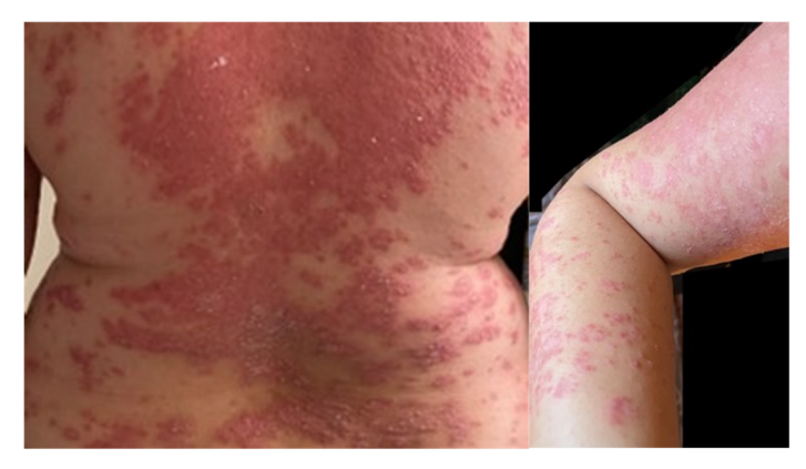
Figure 1 . Active psoriasis prior to any systemic treatment.

After a risk and benefits discussion, the decision was made to start treatment with certolizumab given the greater availability of pregnancy data compared to other biologic agents. However, screening laboratory tests revealed a positive hepatitis B surface antigen, quantitative hepatitis B surface antibody <5 mlU/mL, positive total hepatitis B core antibody, and a low hepatitis B virus DNA level of 10IU/mL, indicating an inactive phase of chronic disease. The patient was unaware of any risk factors for or exposure to hepatitis B. Hepatitis C virus was