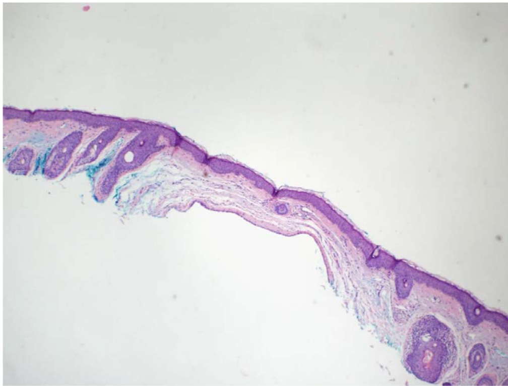
Figure 2. Eccrine hidrocystoma, low-power view: unilocular cystic cavity