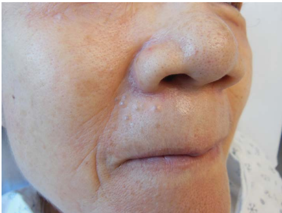
Figure1. Multiple blue-grey, translucent papules on the cheeks and upper cutaneous lip

A 53-year-old woman presented with 10 to 15-year history of multiple asymptomatic papules on the face. Physical exam disclosed approximately 20-30 translucent blue-grey papules on the cheeks, melolabial folds, and the upper cutaneous lip (Figure 1). Shave biopsy was performed. Histopathologic examination revealed unilocular cystic spaces lined by eccrine epithelium with two layers of cuboidal cells (Figures 2 and 3).