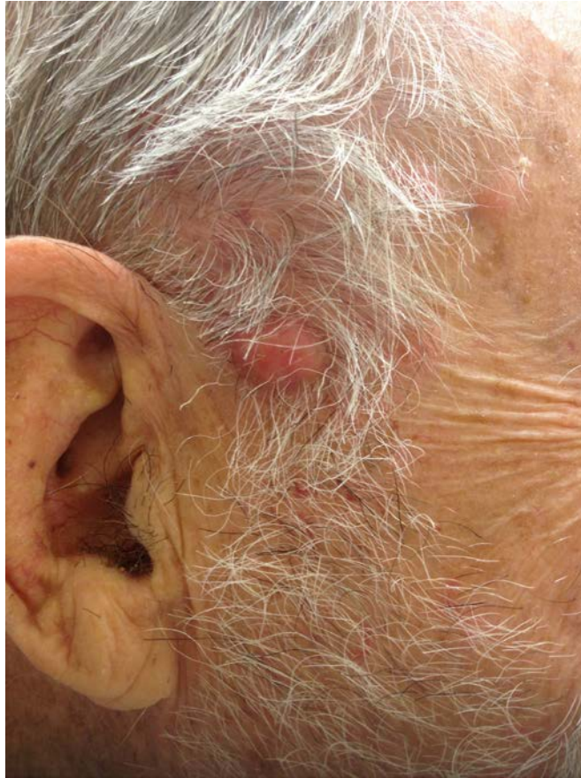
Figure 1. Discrete pink nodules with prominent telangiectasia involving the head and neck

On examination, numerous discrete pink and skin-colored fleshy papules and nodules with prominent telangiectasia were present on his scalp, forehead, pre-auricular cheeks, and neck (Figure 1). He had a well-healed linear scar on his nasal dorsum and chronic actinic damage.