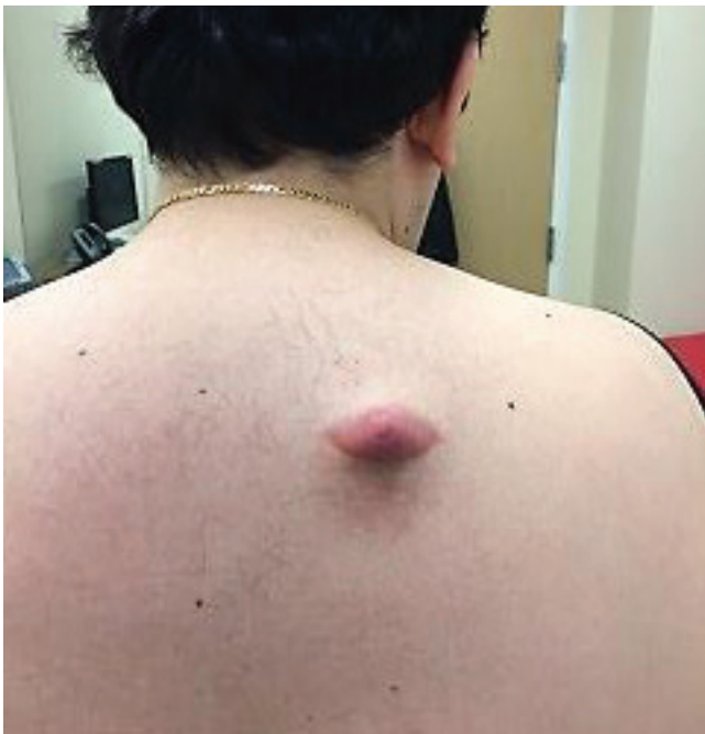
Figure 1. Four subcutaneous, firm, mobile nodules were present on the left forearm and on the right upper, left upper, and left mid back. The largest nodule on the right upper back measured 4-cm x 2-cm with a linear hyperpigmentation that was consistent with a scar from a prior procedure.

PHYSICAL EXAMINATION: Four subcutaneous, firm, mobile nodules were present on the left forearm and on the right upper, left upper, and