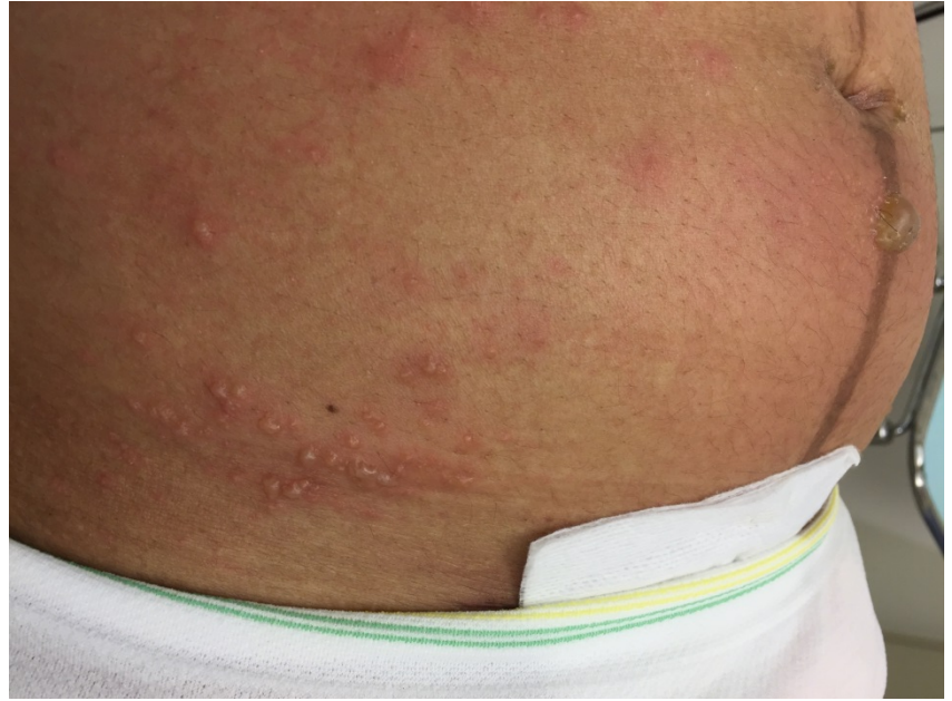
Figure 1. Tense bullae on abdomen in postpartum patient.

Two weeks prior to delivery she reported intense pruritus around her umbilicus, inner thighs, and hands. Initially, there were no skin lesions present, but shortly after delivery she developed blisters on her abdomen. Approximately 5 days after the initial blisters developed, she presented to us again. On exam, she had multiple tense vesicles and bullae on an erythematous base on her abdomen (Figure 1) and medial thighs. Additionally, there were several tense vesicles on her upper and lower extremities.