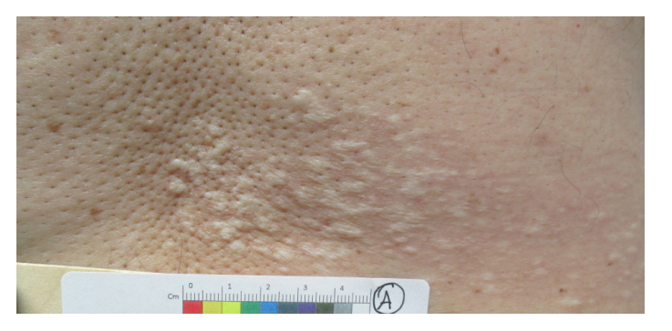
Figure 1. Fleshy white papules coalescing into cobblestone-like plaques in dermatomal pattern on the right lower back from midline to flank.

of fibroelastolytic papulosis or papillary dermal elastolysis. The patient, after being reassured of the benign nature of the condition, declined treatment with both topical tretinoin and CO<sub>2</sub> laser resurfacing.