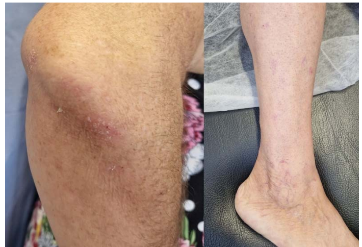
Figure 2. Resolution of lesions after 12 weeks of treatment with tildrakizumab.