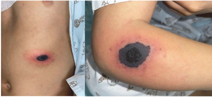
Figure 1. Violaceous plaques with necrotic center and perilesional erythema on the left hemithorax and right arm.

microbiota. Treatment was modified and piperacillin-tazobactam was administered, also without improvement of the skin lesions or remission of the fever. Finally, owing to the lack of clinical and analytical response to intravenous antibiotics, meropenem 120mg/kg/day in extended perfusion and liposomal amphotericin B, 5mg/kg/day was started as antifungal therapy, complementary to the voriconazole with which the patient was already being treated at the time of admission. In addition, treatment with lenograstim (granulocyte colony-stimulating factor) was added at a dose of 150µg every 24 hours.