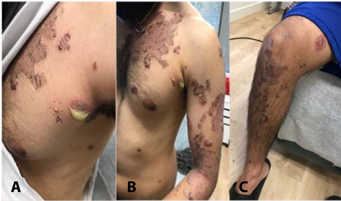
Figure 1. A) Flaccid vesiculopustular on the left axilla. B) Large superficial crusted serpiginous plaques on the left chest. C) Multiple superficial crusted papules coalescing into a plaque on an erythematous base on the right leg.

biopsy revealed subcorneal pustules accompanied by mild spongiosis and a concomitant mixed neutrophilic and lymphocytic infiltrate, most consistent with the clinical impression of Sneddon-Wilkinson disease ( Figure 2 ). There were no features to suggest an underlying autoimmune vesiculobullous disorder such as pemphigus.