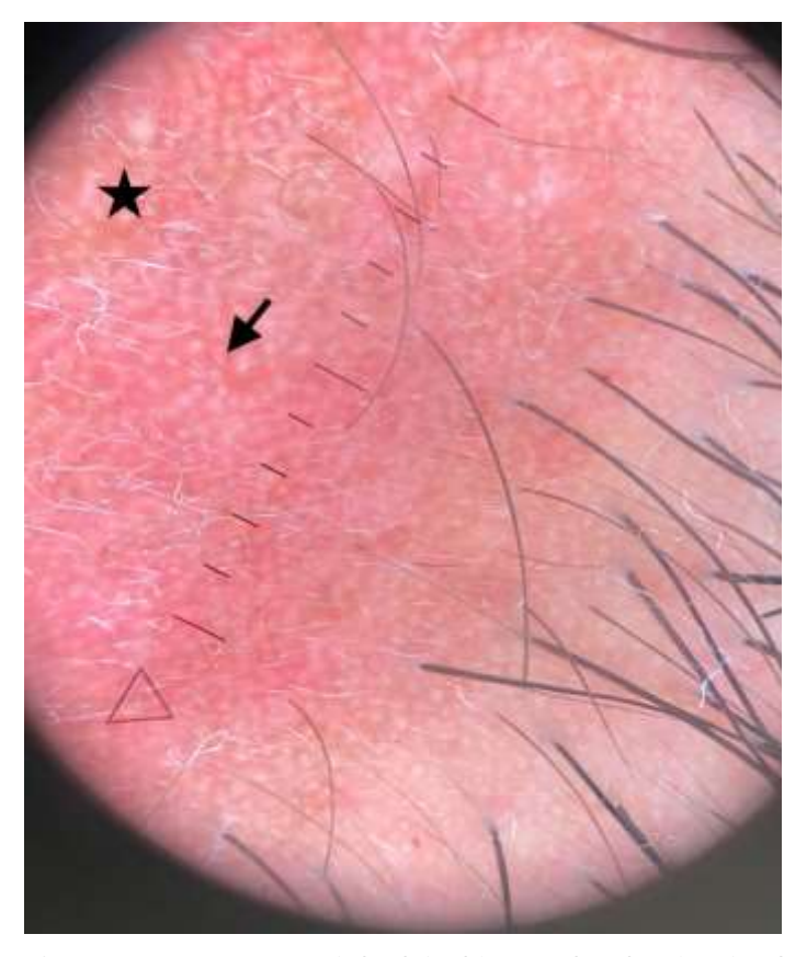
Figure 2. Dermoscopy of the left chin papules showing focal orange structureless areas (star) with follicular openings filled with round and white keratotic plugs (arrow). Dermoscope: Heine DELTAone.

characteristic histopathological features, the diagnosis of acne agminata was made. He was initiated on daily oral prednisolone 40mg (0.5mg/kg) with a tapering course of 5mg every week. Follow-up after six weeks showed almost complete resolution (Figure 1C). Further review at six months showed no recurrence.