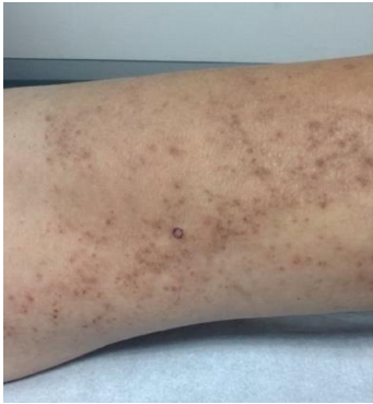
Figure 1. Photo of left upper medial thigh at time of presentation. Papules and crusting due to segmental Darier disease are present.

grains ( Figure 2 ). With the history, clinical presentation and this pathology, a diagnosis of segmental Darier disease was made.