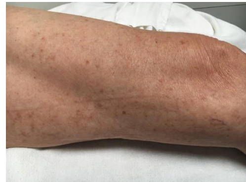
Figure 3. Photo of left upper medial thigh after 6-week treatment with doxycycline. The papules and crusting had resolved, and the patient reported a resolution of symptoms.

The gene mutation that causes Darier disease, ATP2A2 on chromosome 12, encodes the calcium pump \text{Ca}^{2+} -ATPase type 2 (SERCA2) [3]. Calcium homeostasis is thought to influence cell-cell adhesion via several mechanisms. In vitro, the