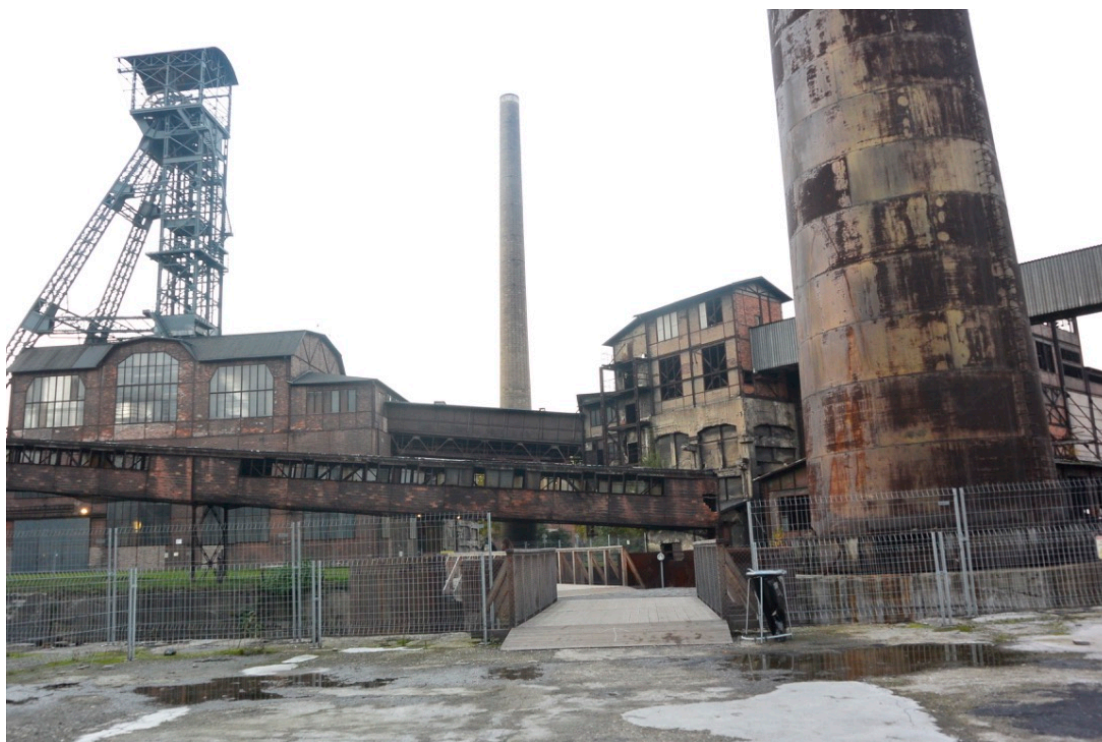
Figure 1. Ostrava’s former steelworks Dolní Vítkovice (closed down by 1998) received the status of “national cultural memorial” in 2002. Photo by author, March 2016.