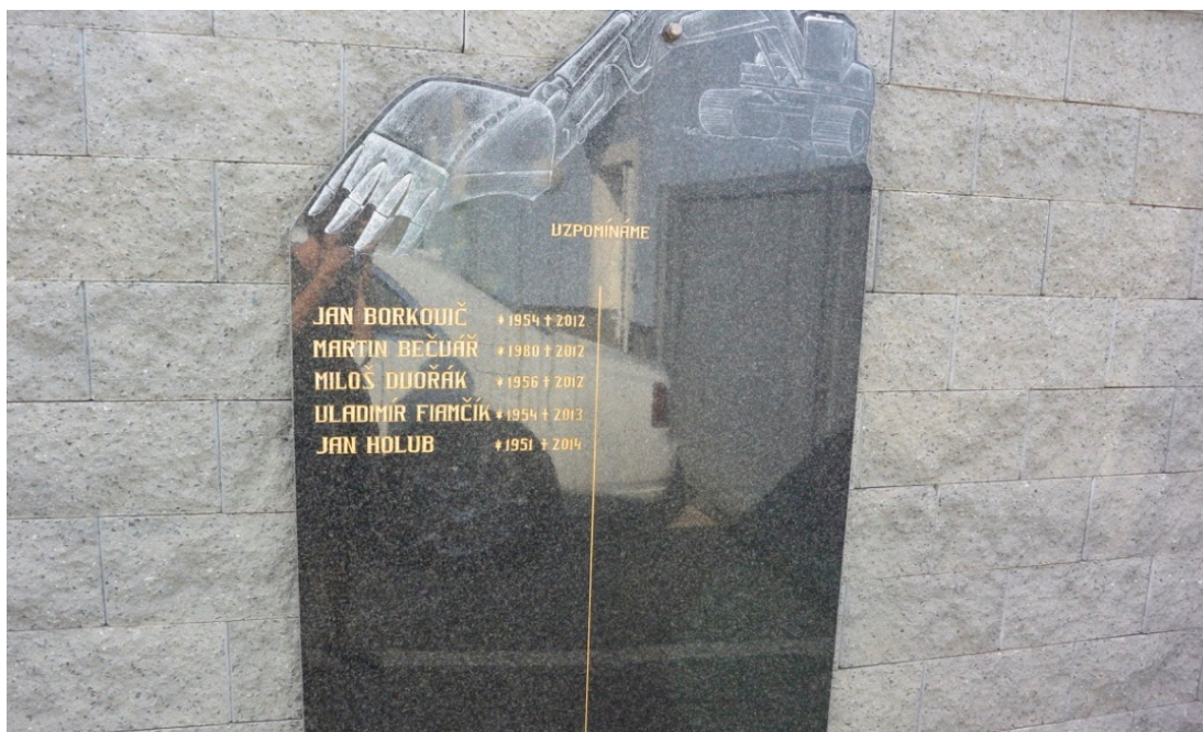
Figure 4. A memorial plate at the entrance to the office of one of the construction companies, featuring the names of construction workers who died while working on projects for the company.