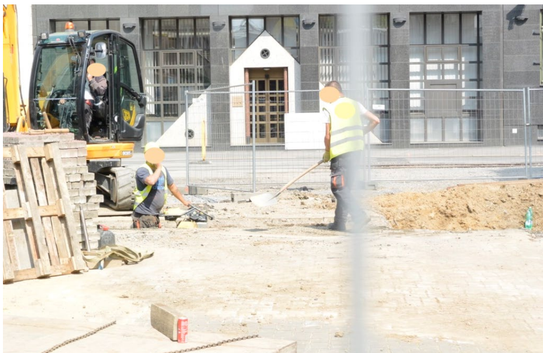
Figure 3. Roma construction workers digging a road in the center of Ostrava.