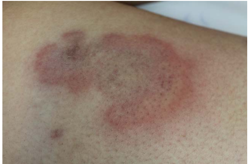
Figure 1 and 2. Erythrocyanotic papules and plaques located bilaterally on the buttocks