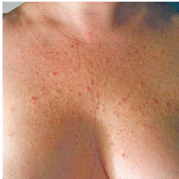
Figure 1. Multiple erythematous papules on chest

Histopathology: There is a circumscribed proliferation of blood vessels within the reticular dermis. The vessel walls are slightly thickened and are lined by plump endothelial cells. There is an accompanying infiltrate of lymphocytes, eosinophils, and mast cells.