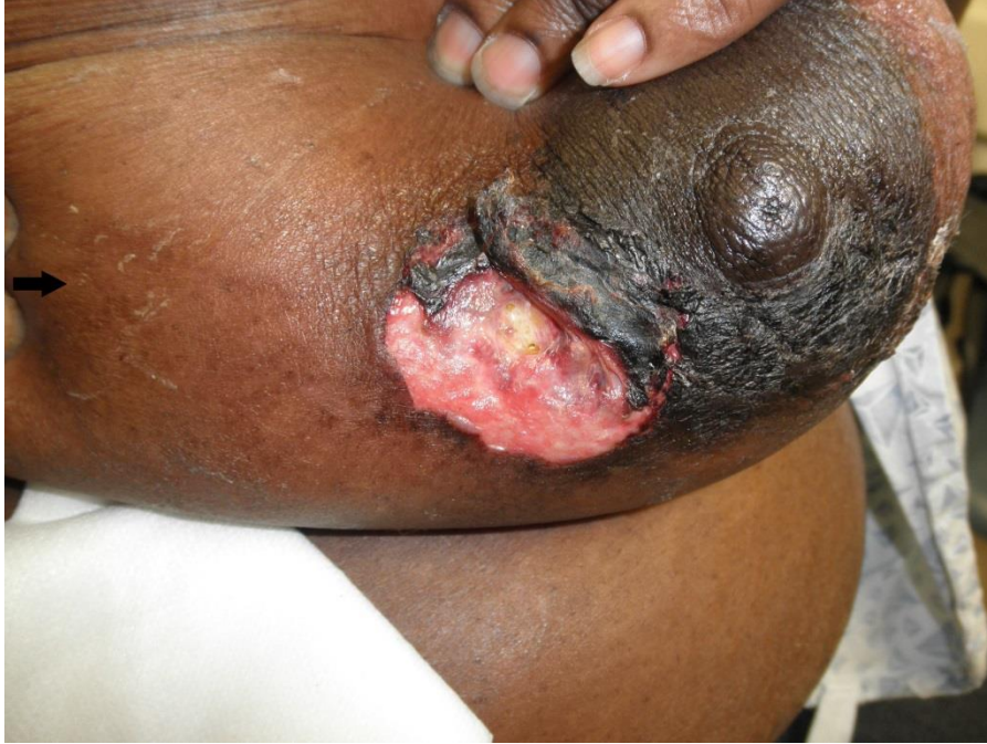
Figure 1. Diffuse dermal angiomatosis: large periareolar ulcer with hemorrhagic crusting. Note adjacent subtle reticulated red-brown patch (arrow).

A 50-year-old woman was referred to our clinic with a 2 month history of an erythematous plaque on her right breast that had become tender and ulcerated over a four week period. She denied trauma to the breast or a prior history of tobacco use. Her past medical history was significant for end-stage renal disease, hypertension, and obesity. Examination revealed pendulous breasts with pronounced underlying nodularity. The right breast contained an extremely tender peri-areolar ulcer with overlying hemorrhagic crust (Figure 1). The left breast demonstrated a subtle, slightly tender, erythematous and reticulate patch.