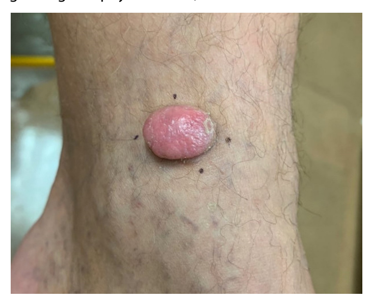
Figure 1 . A 1.8 cm exophytic pink plaque on the left medial ankle.

Lipidized fibrous histiocytoma is a rare, and underrecognized form of dermatofibroma (fibrous histiocytoma) that presents as a solitary, slowgrowing exophytic tumor, that favors the lower