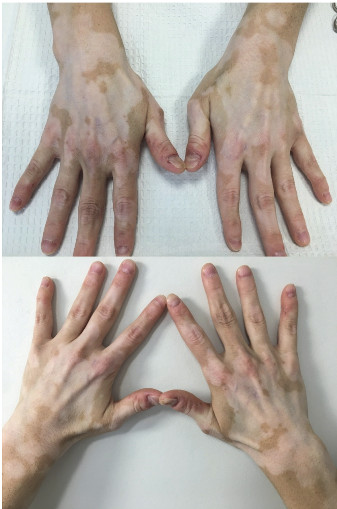
Figure 1. Development of vitiligo on the dorsal hands after four months of treatment with tofacitinib citrate extended-release 11mg daily for rheumatoid arthritis.

tofacitinib she reported good efficacy of tofacitinib for her joint pain, along with the concurrent development of depigmented patches on her neck, chest, arms, and hands, for which she was referred for dermatology consultation ( Figure 1 ). Routine laboratory tests, including complete blood count and comprehensive metabolic panel, were stable during her four-month treatment on tofacitinib, with an overall decrease in erythrocyte sedimentation rate from 41mm/hr to 26mm/hr. The diagnosis of generalized vitiligo was made based on clinical presentation and tofacitinib was immediately discontinued. The patient followed up in dermatology clinic six weeks ( Figure 2 ), three months, and six months later without notable repigmentation or progression of vitiligo. Approximately 18 months later, she self-reported no change in the severity and extent of involvement of