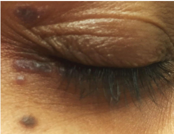
Figure 1. Polygonal violaceous papules of right upper and lower eyelids

experienced moderate symptomatic improvement. The lesions on her chest, post-auricular region, and shin resolved with therapy. After eight months, although she remained symptomatically stable, the violaceous papules on her eyelids persisted.