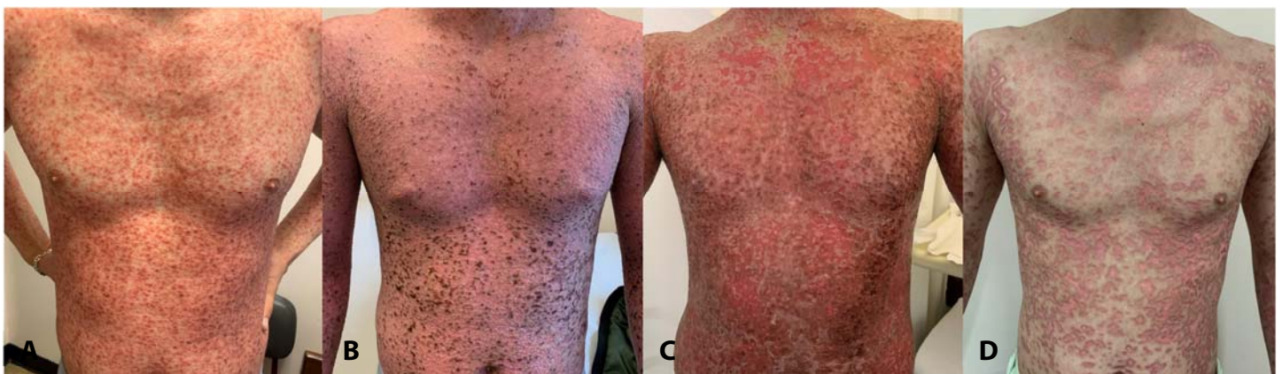
Figure 1. A) Ulceronecrotic lesions on the torso during hospital admission at day one after admission with papulopustular eruption. B) Evolution of lesions at day four with visible scaly lesions and crusts. C) Evolution of lesions at day 8 with ulceronecrotic lesions and epidermal detachment areas. D) Lesions at day 41 with re-epithelization and scarring.

Because FUMHD represents a challenging diagnosis and no unified criterion exists, Nofal et al. have proposed a subset of criteria comprised of constant features, which are found in every case of FUMHD and can confirm the diagnosis alone. In addition, variable features were identified to help ensure that cases of FUMHD are not missed ( Table 1 ), [12,27]. Skin biopsy of a nonulcerated lesion of FUMHD