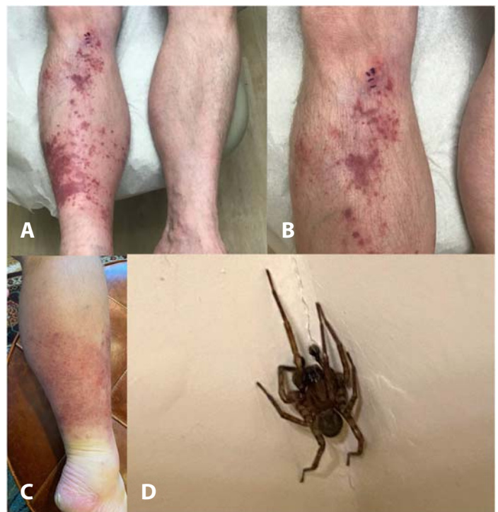
Figure 1. Clinical images of unilateral vasculitis secondary to possible hobo spider bite. A-B) Palpable purpura over the right anterior shin onto the calf, C) with a significant localized pain over the distal mid-calf. D) The possible suspect, hobo spider.

A 63-year-old man with history of well-controlled psoriasis presented with two days of palpable purpura over the right anterior shin and calf with notable point tenderness on the distal mid-calf without any palpable deep abnormality ( Figure 1A-