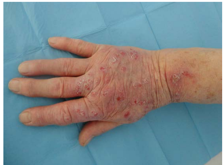
Figure 1. Clinical aspects. Erythema and edema with nodules, some of them ulcerated, and crusts all over the hand

An otherwise healthy 85-year-old woman presented with a 2-month history of deep erythema, subcutaneous nodules, and a painful and swollen right upper limb. Upon physical examination, the patient had erythema and edema with nodules, some of them ulcerated, and crusts all over her right hand and distal forearm (Figure 1). There was no lymphadenopathy and the patient denied fever, arthralgia, or any systemic symptoms. She recalled that she had wounded her second finger of the right hand while she was preparing fish and that the initial nodule had appeared near the initial trauma site after 2-3 weeks. The disease had progressed and other nodules appeared in a sporotrichoid pattern following lymphatic drainage. Before our visit, the patient had already been treated with empiric antibiotics such as amoxicillin for two weeks and ciprofloxacin for another two weeks without