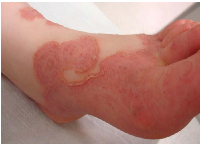
Figure 3. Cutaneous lesions on the foot with an erythema gyratum repens-like pattern

In our patient the lesions appeared in parallel with constitutional symptoms and it was possible to make the diagnosis of SLE by clinical manifestations and laboratory testing.