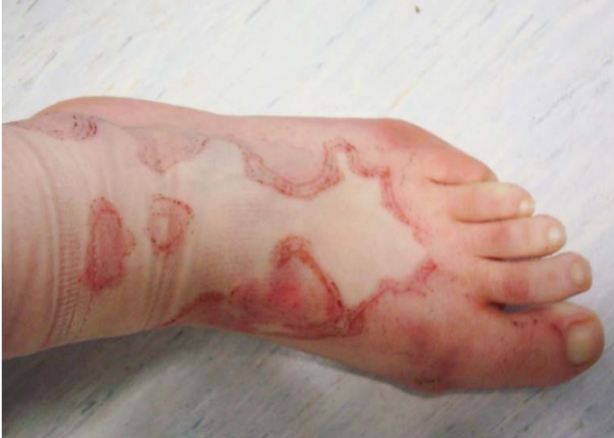
Figure 5. Postinflammatory patch after one week of dapsone.

The histopathology of BLE is described as showing subepidermal bullae with a dermal inflammatory infiltration that is mainly composed of neutrophils, sometimes leading to neutrophilic microabscesses in the papillary dermis, a pattern similar to dermatitis herpetiform [8, 9]. Direct immunofluorescence shows a granular and/or linear deposition of IgG; sometimes IgA, IgM, and complement components are also observed at the dermal-epidermal junction [9]. Most patients have a positive anti-nuclear antibody and commonly, anti-double stranded DNA and anti-collagen type VII [10]. Dapsone is the first-line treatment that generally produces cessation of new blister formation and complete resolution of the dermatosis within days, frequently leaving postinflammatory hypopigmentation or hyperpigmentation [5, 9]. Typically, there is minimal response with corticosteroids and other immunosuppressive drugs [5, 11]. Our patient met the 2012 Systemic Lupus International Collaboration