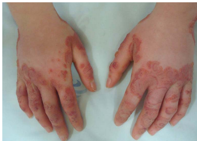
Figure 2. Erythematous plaques with vesicles and tense blisters on both hands

rheumatology and nephrology who confirmed the involvement of more than two joints and lupus nephritis. Screening for malignancies was negative. With all this data the diagnosis of systemic lupus erythematosus with an erythema gyratum repens-like pattern of cutaneous bullous lupus was made.