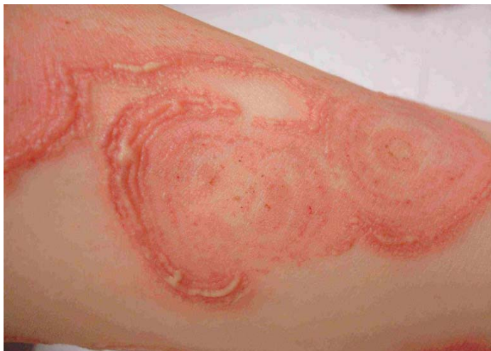
Figure 1. Polycyclic and annular plaques with vesicles on the periphery creating a wood grain pattern in the leg.