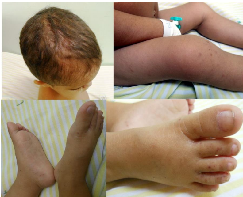
Figure 1. Cutaneous examination revealed yellowish greasy scales and crusts over the scalp and small number of purpuric papules over the trunk, feet, arms and legs

His fingernails showed onycholysis, subungual hyperkeratosis, and hemorrhages (Figure 2).