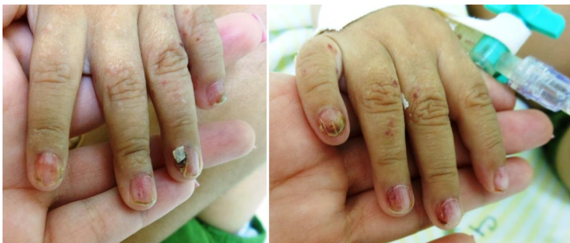
Figure 2. Fingernails with onycholysis, subungual hyperkeratosis and hemorrhages

His fingernails showed onycholysis, subungual hyperkeratosis, and hemorrhages (Figure 2).