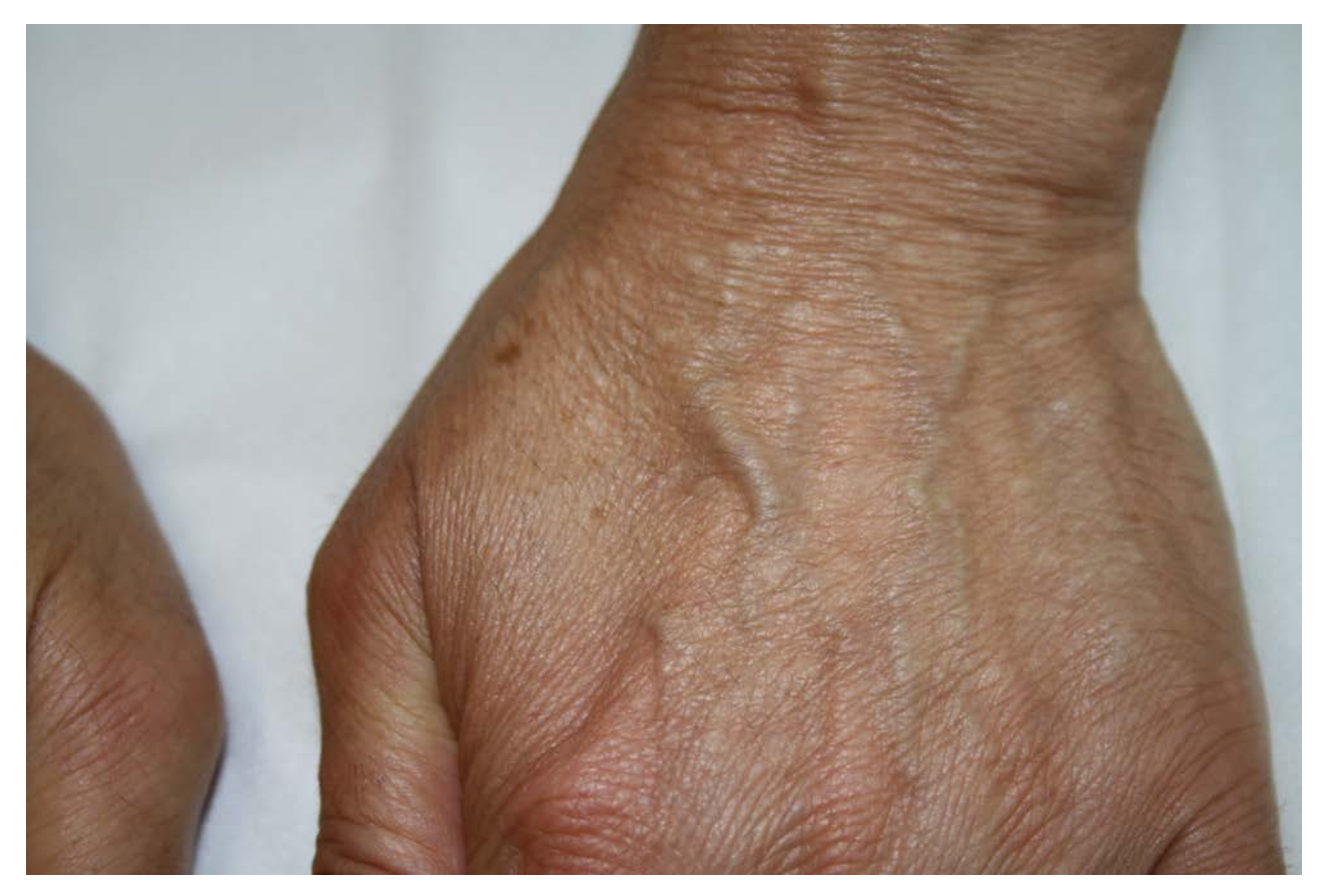
Figure 1. Flesh-colored to translucent papules, round and firm, on the back of both hands