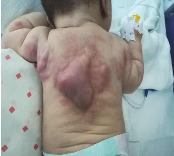
Figure 1. A large liquefied component of one plaque on the back, 6cm×10cm in size.

discomfort and the lack of regression of the very large plaque. It allowed the draining of about 20 ml of thick liquid. Samples of the fluid were sent to the laboratory of bacteriology and anatomic pathology. Blood cultures were sterile. On the seventeenth day of life, biological monitoring revealed persistent thrombocytopenia and hypercalcemia with a serum level reaching 2.85mmol/L. It was treated with low calcium and vitamin D intake and hyperhydration. The triglyceride level was normal at 2.1mmol/L. The