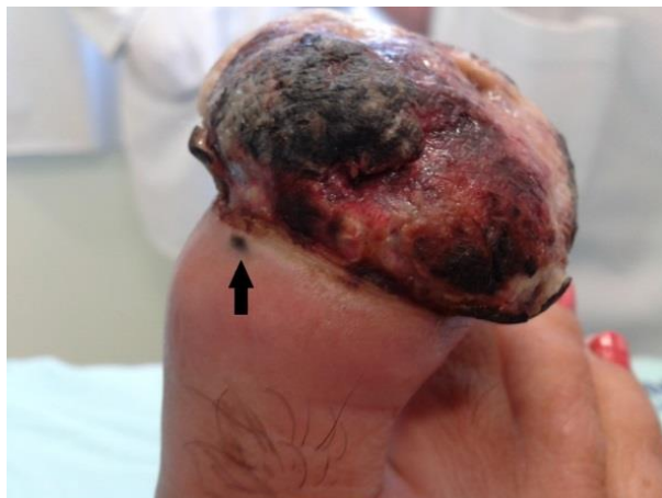
Figure 1. Necrotic tumor of great toe measuring approximately 5 cm. Proximal portion shows Hutchinson sign (black arrow).

A 41-year-old woman, phototype III, presented with a tumor of the right distal toe, measuring approximately 5 cm. The nail plate was missing owing to neoplastic destruction. The proximal portion of the tumor presented with a macular area with discreet dark-brown pigmentation - Hutchinson's sign (black arrow, Figure 1).