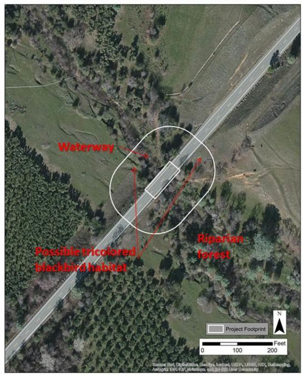
Figure 1. Estimated project footprint and some of the potential impacts.