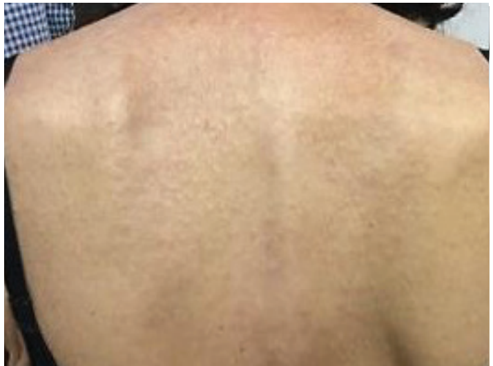
Figure 1. Numerous, skin-colored-to-slightly-white, 2-to-3-mm papules were scattered on the posterior aspect of the neck, abdomen, and central portion of the upper back.