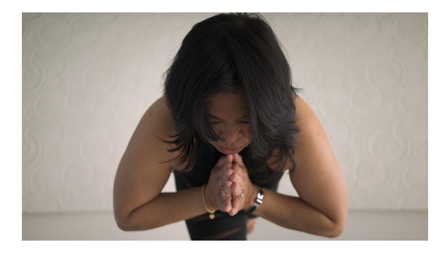
The filmmaker practicing yoga in grief. Still from The Celine Archive (http://celinearchive.wordpress.com/images). Used with permission.

JB: My two questions for Celine: Was there ever any discussion of using DNA and forensic anthropology to look at those pauper's graves and see if perhaps those are her remains?