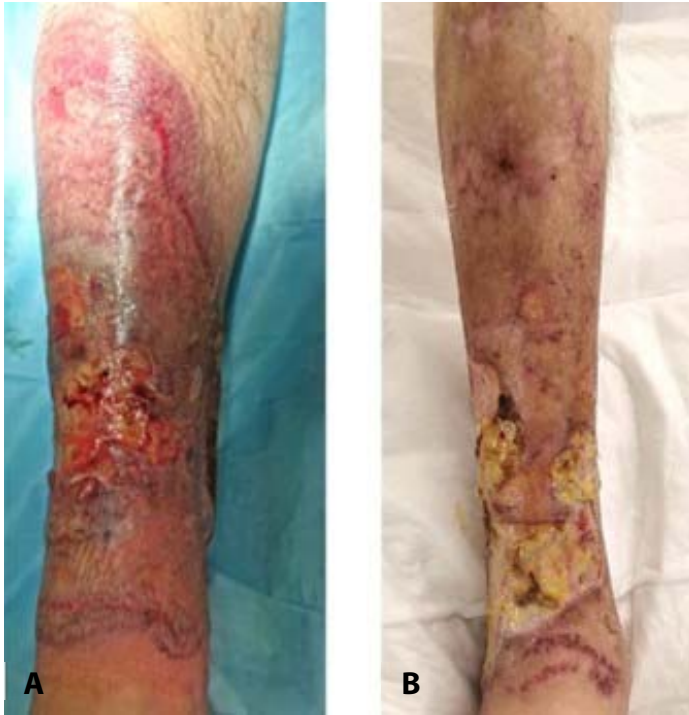
Figure 1. A): Expanding ulcer with violaceous undermined border during hospitalization. B) Cutaneous presentation following two weeks of corticosteroidal treatment.

revealed an elevated C-reactive protein 92mg/dL, procalcitonin 0.14ng/mL, white blood cells 8,440/mm 3 (with 4,800 neutrophils/mm 3 ), hemoglobin 9.7g/dL, and prothrombin time-international normalized ratio 1.32. Electrolytes and liver and renal function tests were normal. A nasopharyngeal swab for SARS-CoV-2 RNA was negative. An X-ray of the right leg showed no fractures and a Doppler ultrasound of the lower limbs was negative for deep vein thrombosis or abscesses.