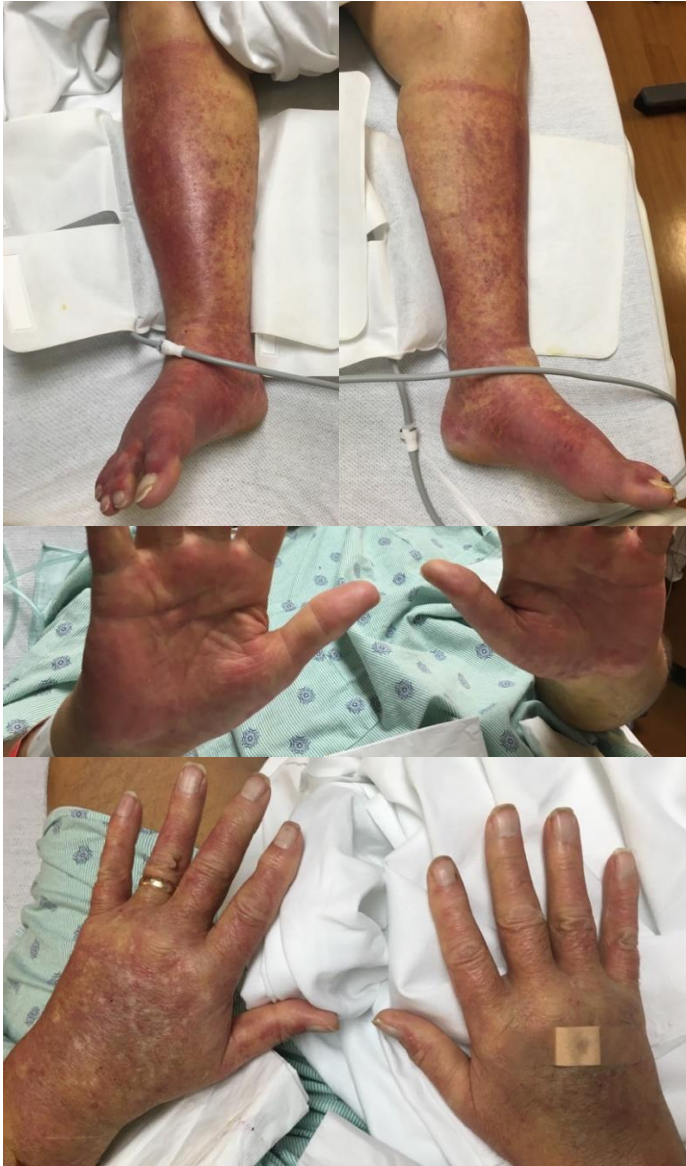
Figures 1. Erythematous, purpuric papules and plaques involving the hands and feet with extension proximal to the ankles.

quantitative PCR values increased from 703,868 copies/mL to more than 1,000,000 copies/mL. The patient's prior influenza B diagnosis was not tested again since the patient's clinical presentation and lab results supported an EBV viremia diagnosis. ANA titer was 1:40 and anti-smooth muscle antibody titer was 1:20.