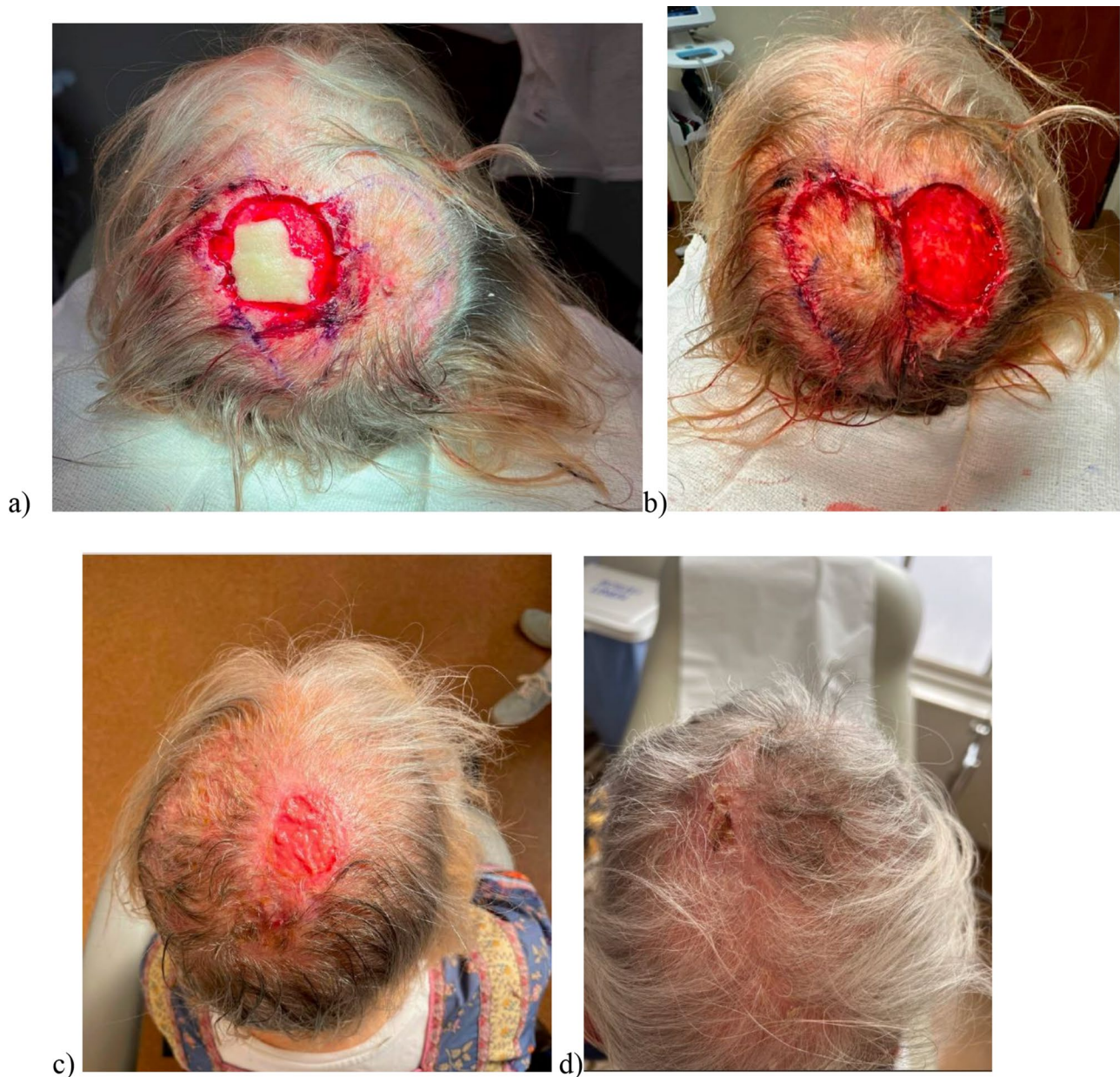
Fig. 2 Progression of a banner flap on occipital scalp from (a) pre-operative flap design, (b) flap during surgery, (c) flap immediately after surgery and (d) flap healed by secondary intention following 1–2 month follow up

inform what reconstructive procedures can be performed [2, 4, 5, 21].