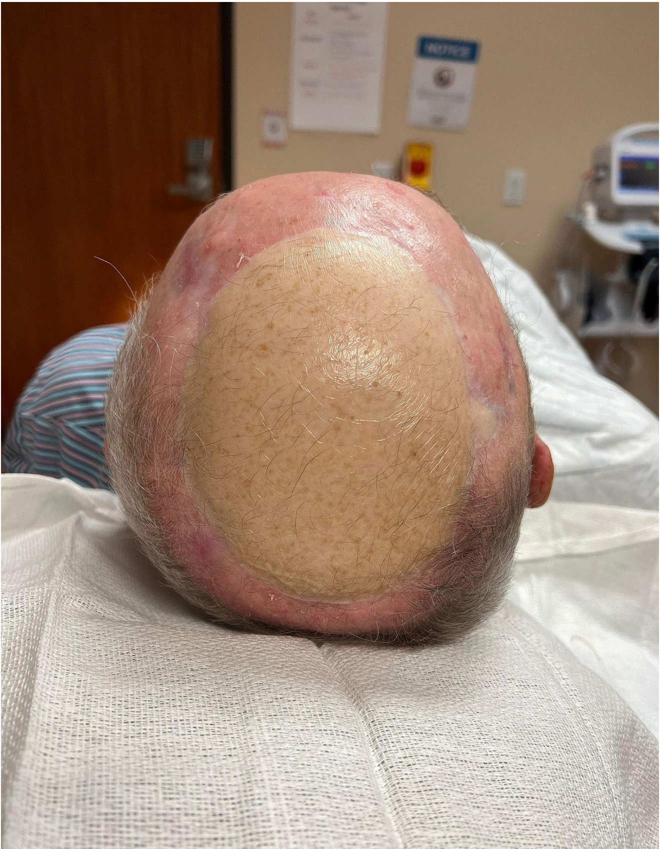
Fig. 3 Post operative free flap on parietal scalp highlighting relatively poor cosmetic results in alopecia patients